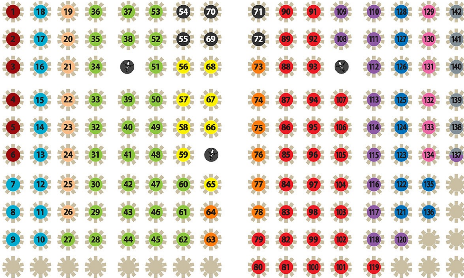
TABLE # CEO ASSIGNMENTS